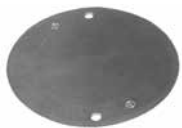
CIC-93 / S341E-R

Note: Covers are raintight when used with appropriate Red Dot boxes. All covers packed with gasket and screws.