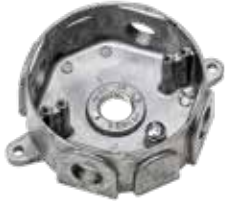
CIC-8444 / CIC-8448