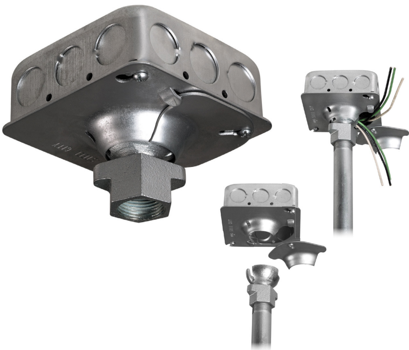
Steel City® hands-free swivel hanger