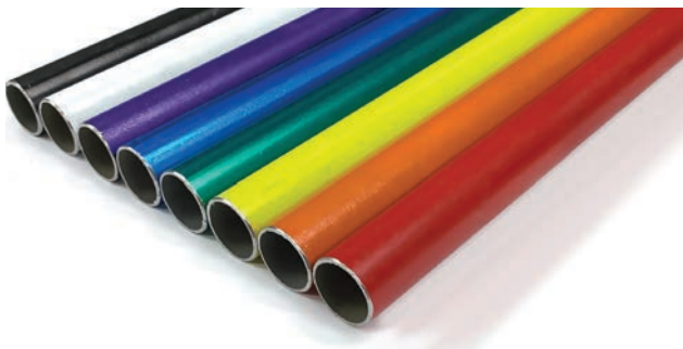
Identify Important Circuits Instantly