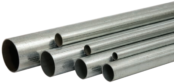
Quality Electrical Metal Tubing