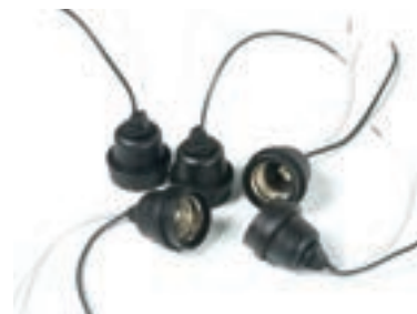
Pigtail Lamp Sockets Part Number: 16023