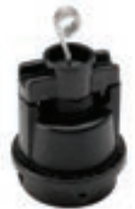
Insulation Piercing Lamp Socket Part Number: 16022