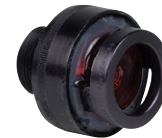
Lens Guard Assembly