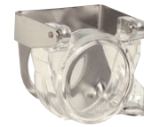
Selector Switch Lockout