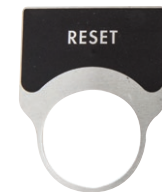
"GO" Legend Plate