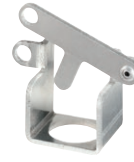
Push Button Lockout GO-8665