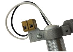
2 Pt. Terminal Block KIT-GOTB