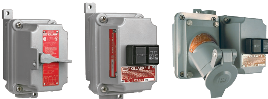
Tumbler Switch Complete Unit (Box and Cover)