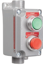
Double Push Button (Box and Cover)