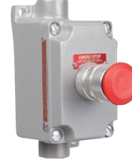
Push-Pull Mushroom Maintained Push Button (Box and Cover)