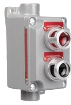
Double Pilot Light (Box and Cover)