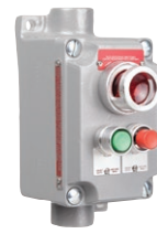
Pilot Light Two Mini Push Buttons (Box and Cover)