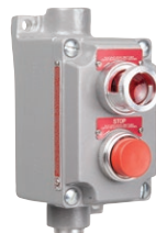
Pilot Light Push Button (Box and Cover)