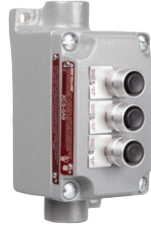
Three Mini-Push Button (Box and Cover)