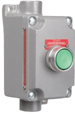
Single Push Button (Box and Cover)