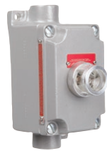
Pilot Light (Box and Cover)