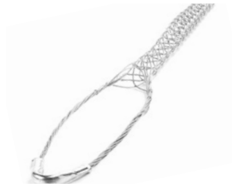
Single Eye Grips