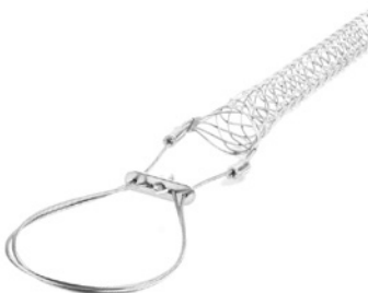
Locking Bale Grips (Universal Eye)

*To determine workload safety factor, divide approximate break strength by 10. See page 336 for strength information.