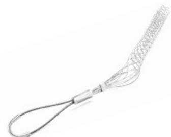
Offset Eye Grips