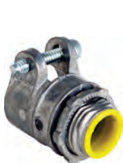
3/8" to 2"