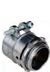
3/8" to 2"