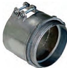
2-1/2" to 4"