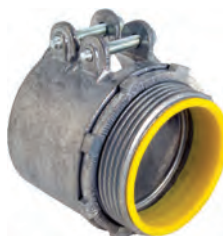
2-1/2" to 4"