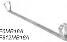
F6MB18A F812MB18A F16MB18A