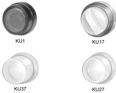
Table 19.294: Protective Boots