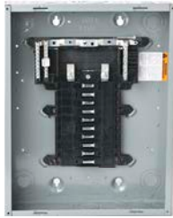
QO Load Center