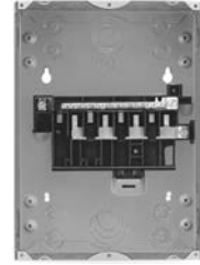
QO816L100F or S without cover