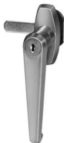
Catalog No. PK4NVL