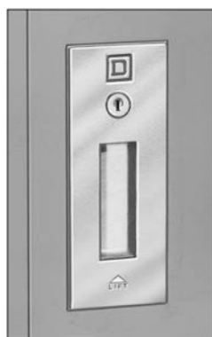
Catalog No. PK5FL