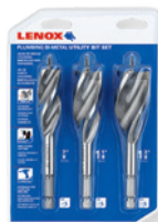
14787300PS 3 PIECE PLUMBER'S SET 7/8", 1-1/8", 1-3/8"