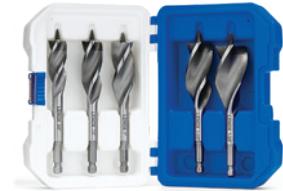
14788500Pk 5 PIECE PLUMBER'S KIT 3/4", 7/8", 1", 1-1/8", 1-3/8" COMPACT KIT