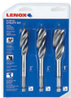
10954300S 3 PIECE SET 3/4", 7/8", 1"