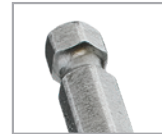
Fits Cordless Drill